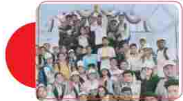
INFORMATION TECHNOLOGY GROUP(MEG) - LIONS -PANTHER