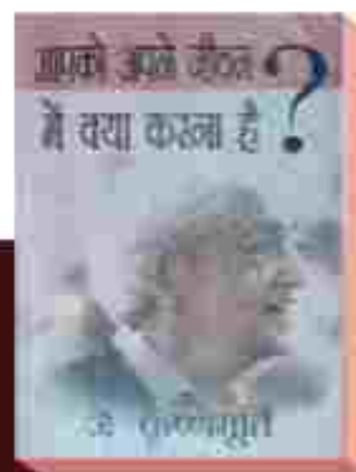
Photos of books displayed on notice board