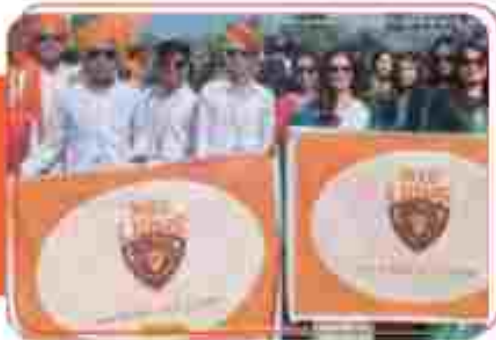
MANAGEMENT EXCELLENCE EXCELLENCE GROUP(ITEG)