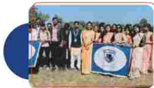
BIO EXCELLENCE GROUP(BEG) - TIGER