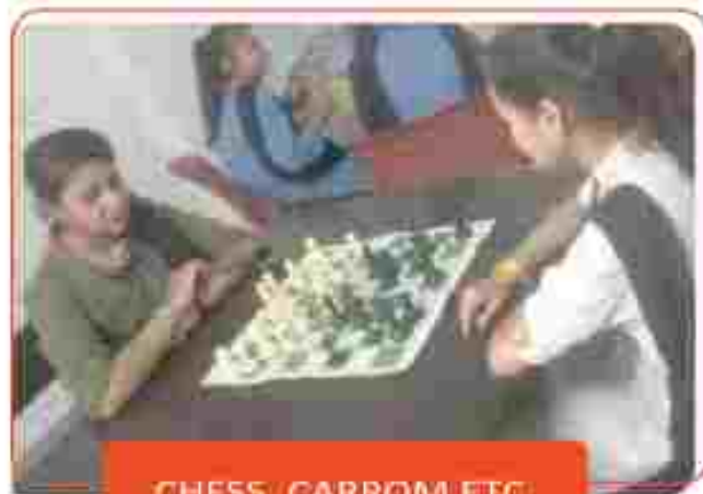
CHESS, CARROM ETC.